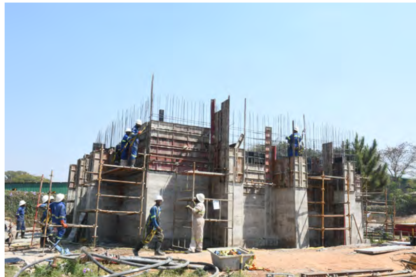
Construction of a Water tank at Lubambe