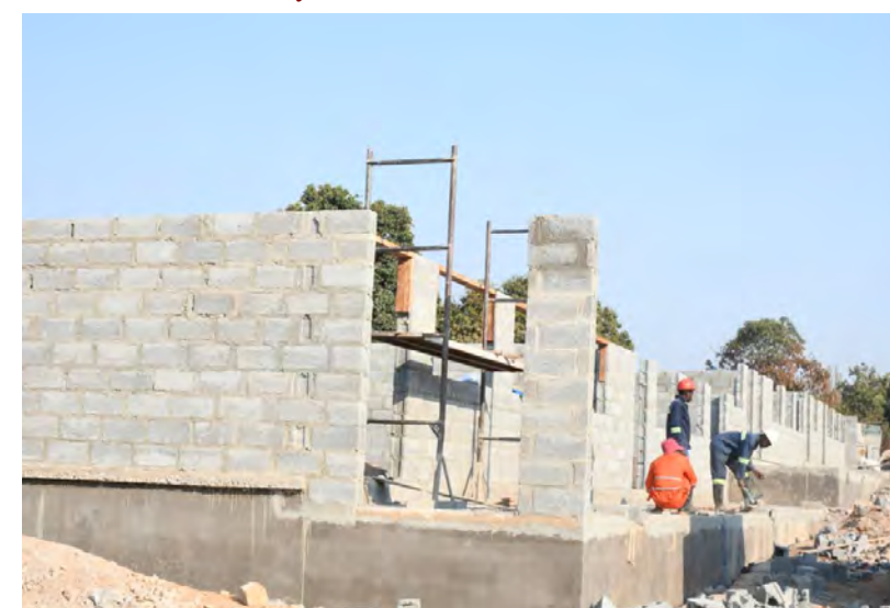
Construction of a classroom block at Golden Eagle in Konkola