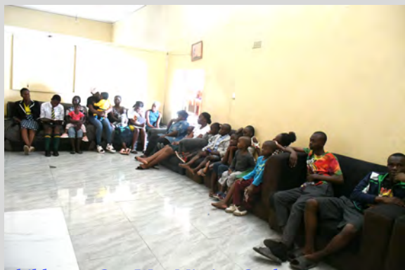
children at One Way Mission Orphanage