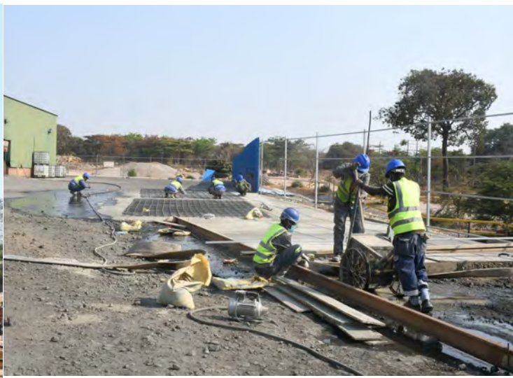
Construction of a Concentrate Yard