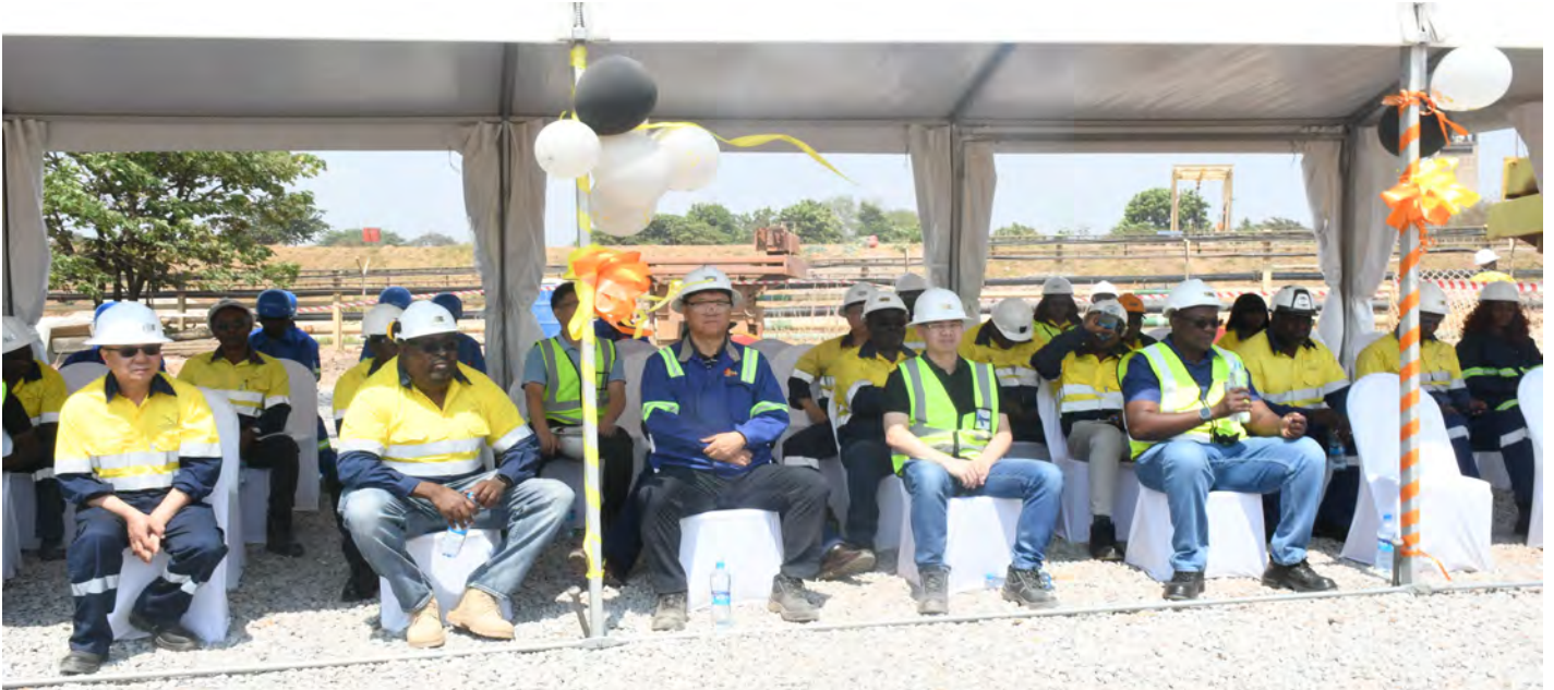
JCHX Mineral Resources Department CEO (in blue) with Lubambe senior management officials during the ground breaking event

On Monday, 23rd September 2024 Lubambe Copper Mine Limited (LCML) held a Ground-breaking Ceremony to celebrate the beginning of the New Shaft construction.