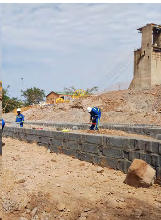
Construction of offices at General Mine Offices