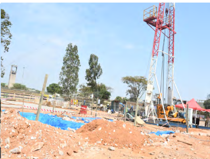
Construction of a New Shaft at Lubambe