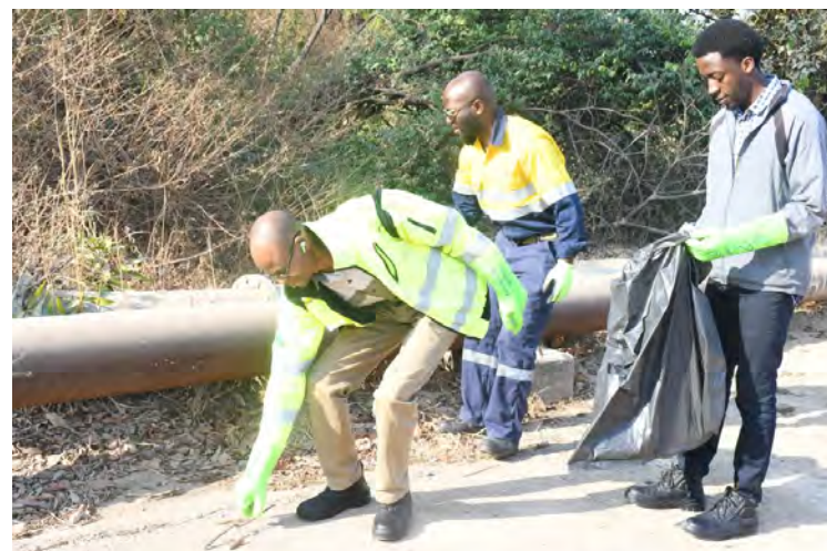
PHOTO FOCUS - LITTER PICKING EXERCISE