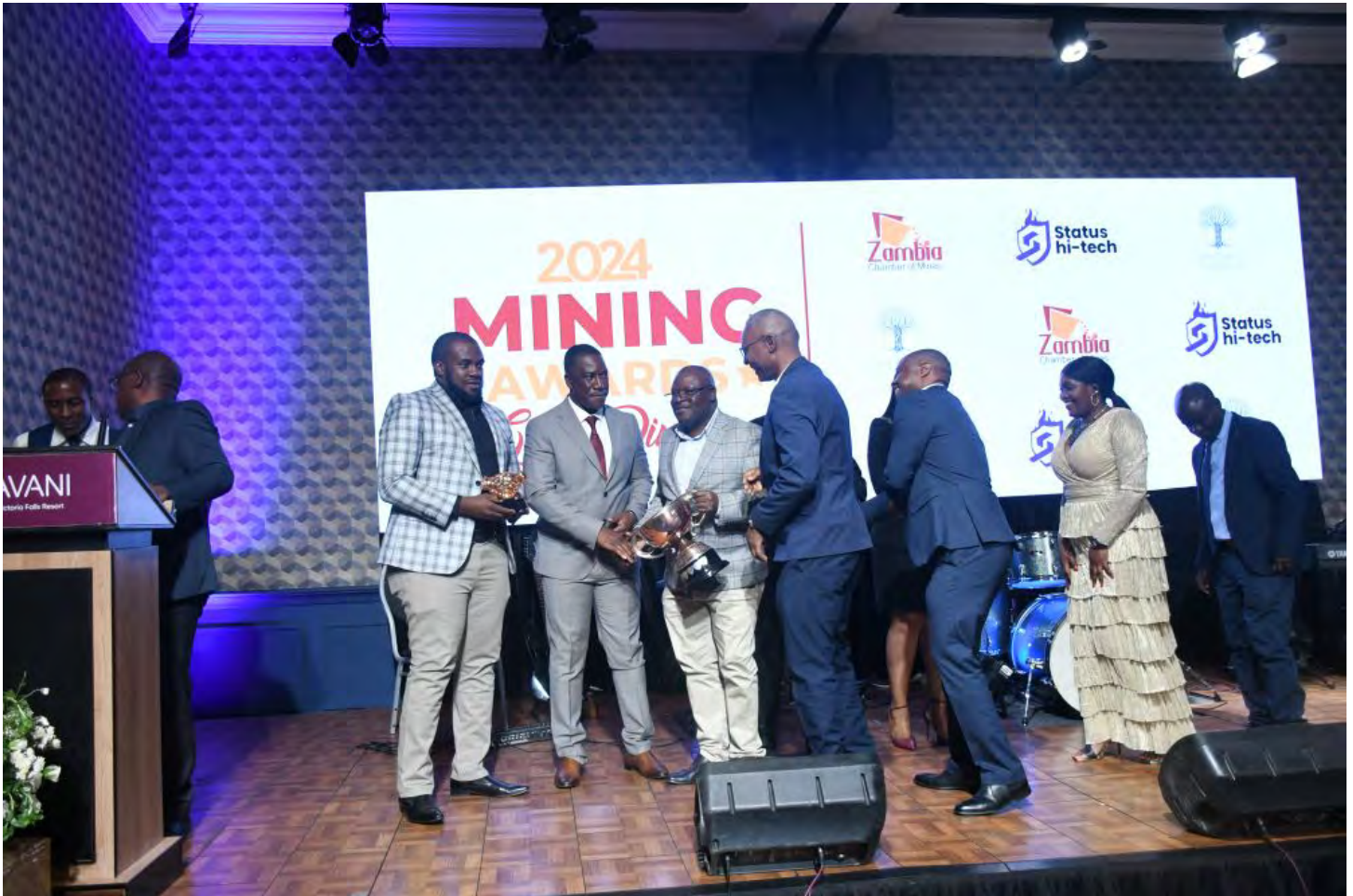
LCML Management Representatives receiving the award on behalf of the Company

Lubambe Copper Mine Limited has been awarded as the best performer in Environmental Management for 2023 by the Zambia Chamber of Mine (ZCM) at the 2024 Mining Awards Gala Dinner held on 30th October, 2024 in Livingstone.