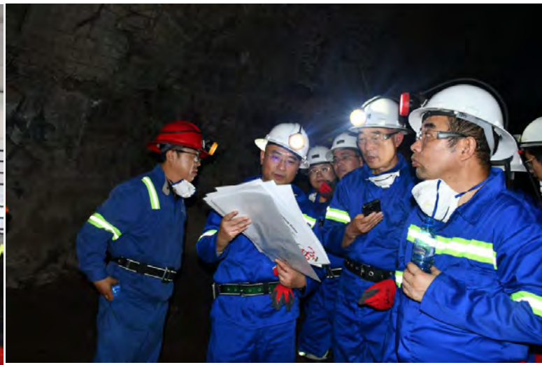
Chinese Academician Academician Wu Aixiang visits Lubambe